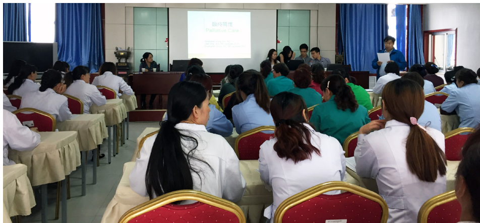
Photo:China West Teaching Team in action.

In a recent mission, the team worked with two young women who joyfully assisted the team because they share the same faith. These two volunteers had once lived in destitution at the same care center. They were adopted at a young age and raised abroad. They returned back as volunteers motivated by their own experience of the generosity and love of other Christians. It was by these two re-entering the lives of the less fortunate that softened the heart of