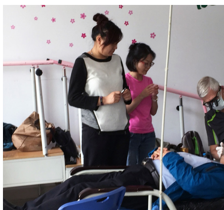
Photo: The love of two volunteers

One team member wrote, “Because of God’s unfailing love reflected in the love and care given by the two women, the director has allowed us to have educational talk in the facility. The educational talks which we are still providing will help raise public awareness and increase the staff’s exposure to higher standards for common healthcare issues.”