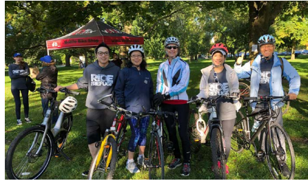
Ride for Refuge Myanmar contingent. 2018

Funds will go to Gambade, Myanmar and our General Fund, where most needed.