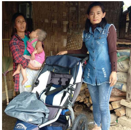
Right: Mother and Child, with stroller

of Lashio was a miracle of God’s providence. A local pastor happened to be in Yangon just when the stroller arrived in the country! And he agreed to take it with him back to the family who needed it. The stroller passed from person to person until it finally reached the woman and her son.