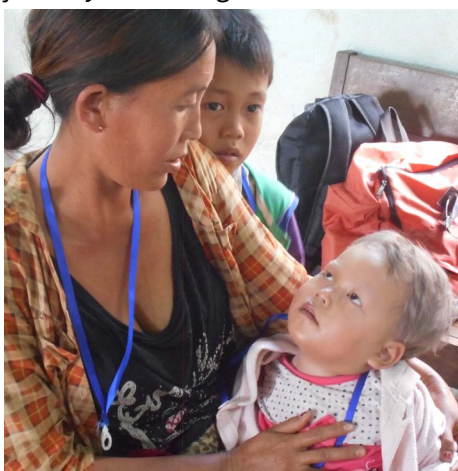
Left: Mother and child at the clinic