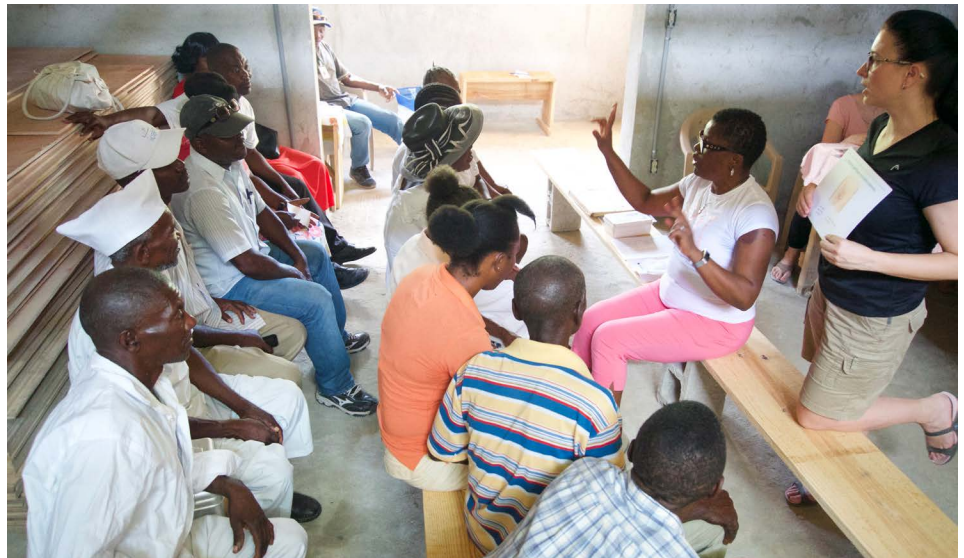
photo: Teaching TBA's and Health agents in Gambade Haiti

In March a teaching team of two Canadian maternity nurses in partnership with a Haitian obstetrician spent three days training traditional birth attendants and health agents in prenatal care, delivery, and post-delivery care. Using videos and model simulations they helped the participants learn and practice the techniques required for safer deliveries. Five expectant women also volunteered so that the TBA's could practice learned skills on real patients. 9 TBA's and 6 health agents took part in the program. This is an ongoing program.