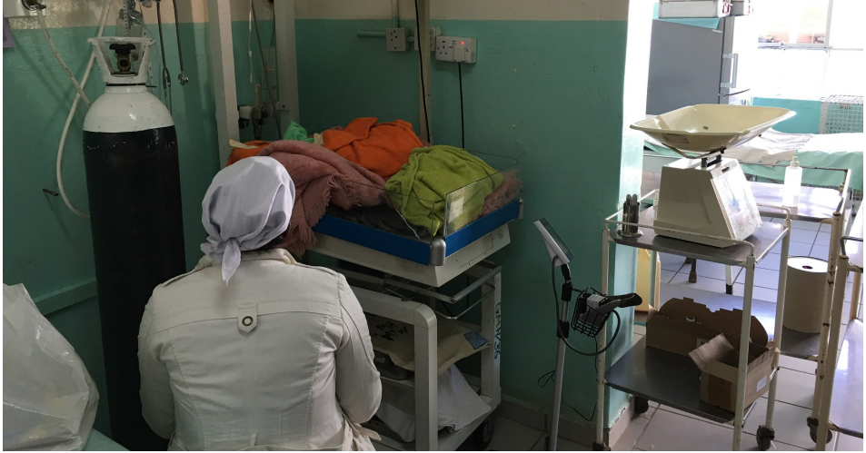
Gutu Mission Hospital Maternity Ward

Our aim is to bring better healthcare to the mothers and infants in