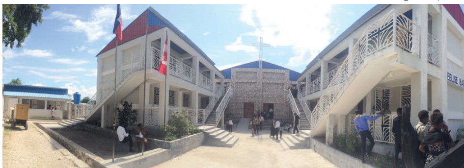
Photo: Haiti's new buildings completed.

Not only are the impressive new buildings a great symbol of hope for the community, but the construction site continues to be a demonstration-training site for proper construction methods using appropriate, available, local technology and materials; and an example of solid financial stewardship. Despite all odds, the El Shaddai community continues to move forward with unrelenting faith, joy and hope that relief, healing and dignity will be realized as EMAS Canada continues to share its blessings with Haiti.